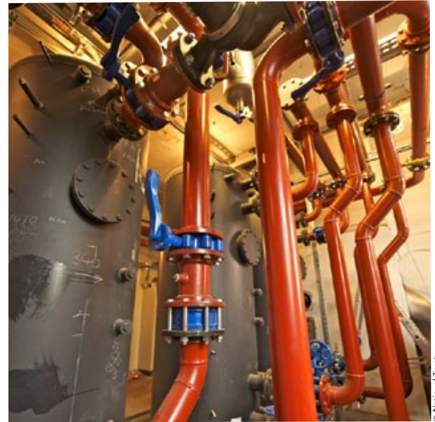
Bottom right Old oil boiler