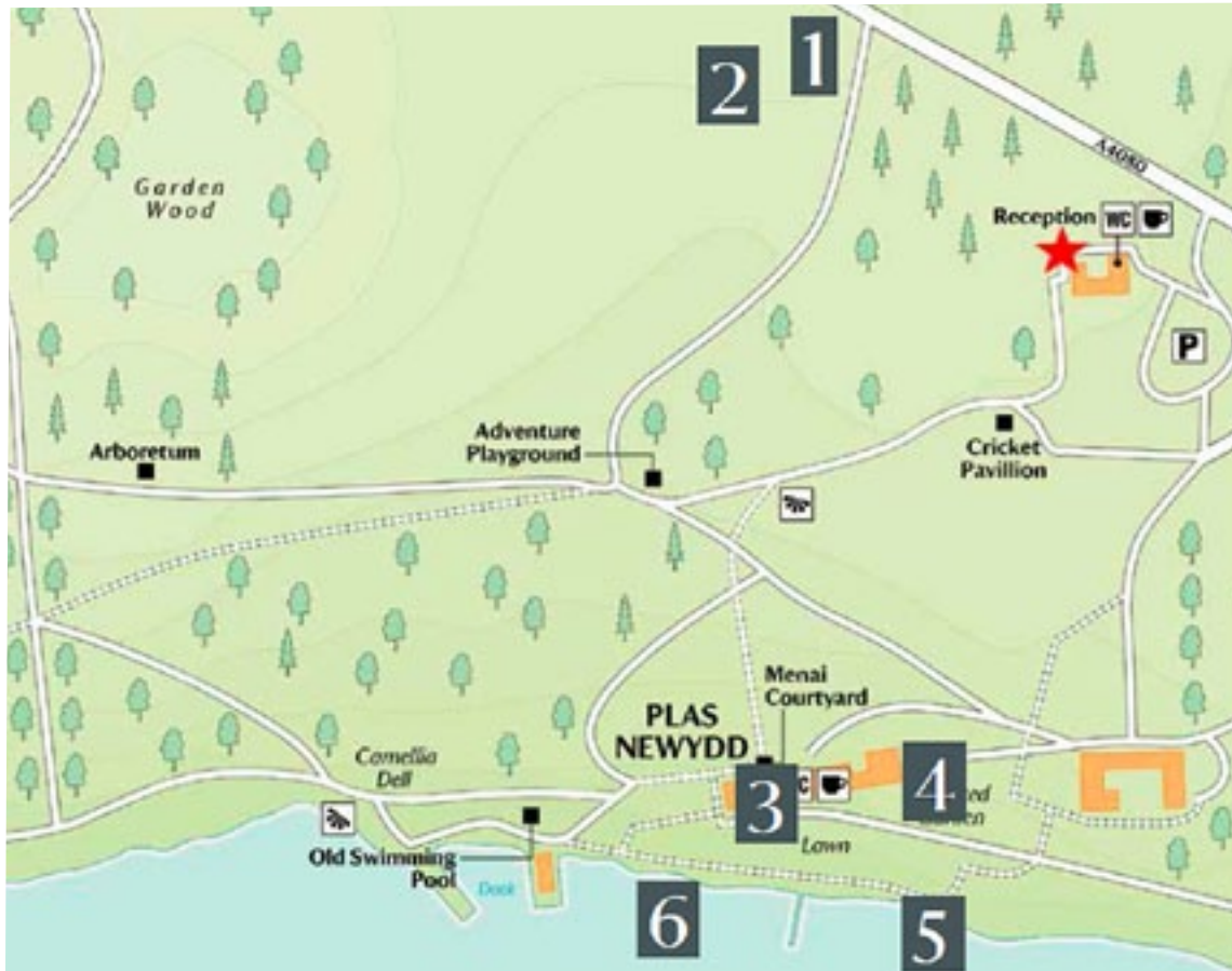
Left Educational ‘green living trail’ map

If you require this information in alternative formats, please telephone 01793 817791 or email buildingdesignguide@nationaltrust.org.uk